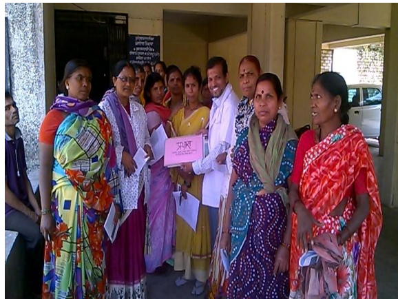
Cervical cancer screening camps in the community