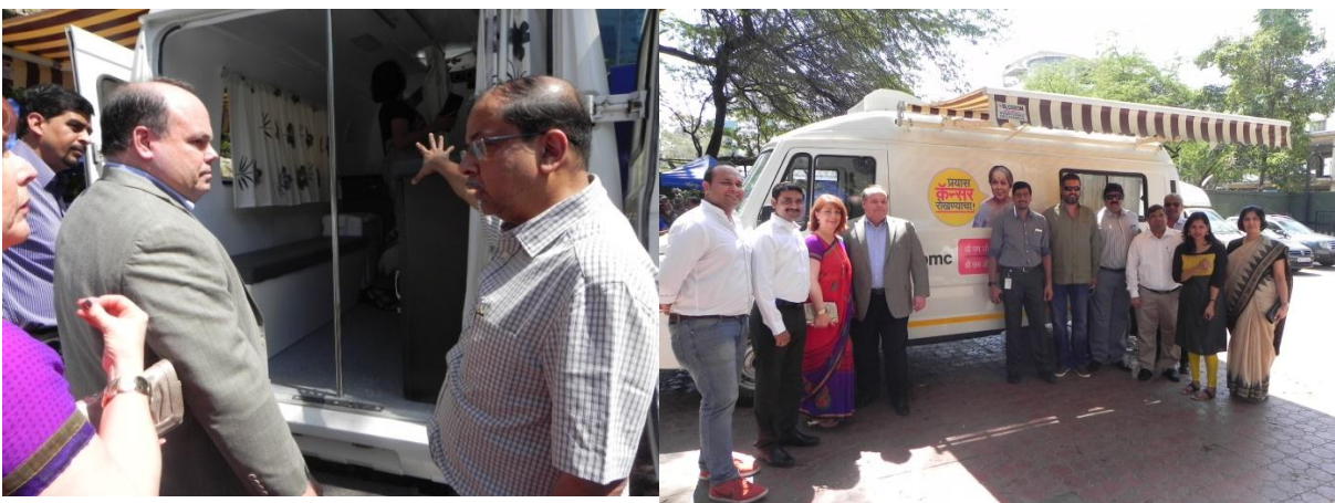
Inauguration of the mobile clinic with the authorities of BMC Software India Pvt Ltd

BMC Software India Private Limited has supported Prayas to conduct 88 cervical cancer screening camps during 2016-2017 in Pune city to increase awareness and to provide free cervical cancer screening to women from the low socio-economic group and for women who are safai karmacharis of PMC or their relatives. The donation was facilitated by Live Life Love Life Foundation through their fundraiser. BMC Software has also donated a mobile clinic which is being used to provide screening and appropriate treatment in the community setting. The project was initiated in November 2016. Cervical cancer screening camps are implemented in collaboration with Pune Municipal Corporation (PMC) after receiving an approval from them. We conduct about 2 cervical cancer screening camps per week at PMC hospitals and dispensaries. From 15 th November 2016 to 31 st March 2017, we have conducted 33 cervical cancer screening camps, treated 43 women in the community and have referred 21 women for additional diagnostic evaluations and treatment at our dedicated clinic for cervical cancer prevention at Prayas.